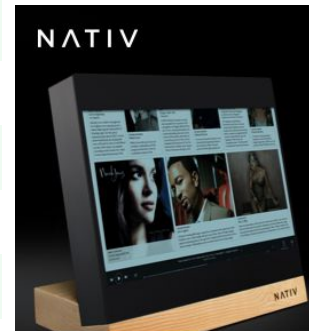
NATIV VITA High-Resolution Music Player